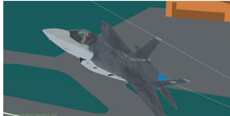
Figure 2 - Advanced interceptor aircraft launch to intercept inbound threats

The AVT tool also enables NORAD to assess the response time of intercept aircraft against potential inbound cruise missile or commercial aviation terrorist threats similar to 9/11. AVT allows NORAD to model a wide variety of interceptor assets